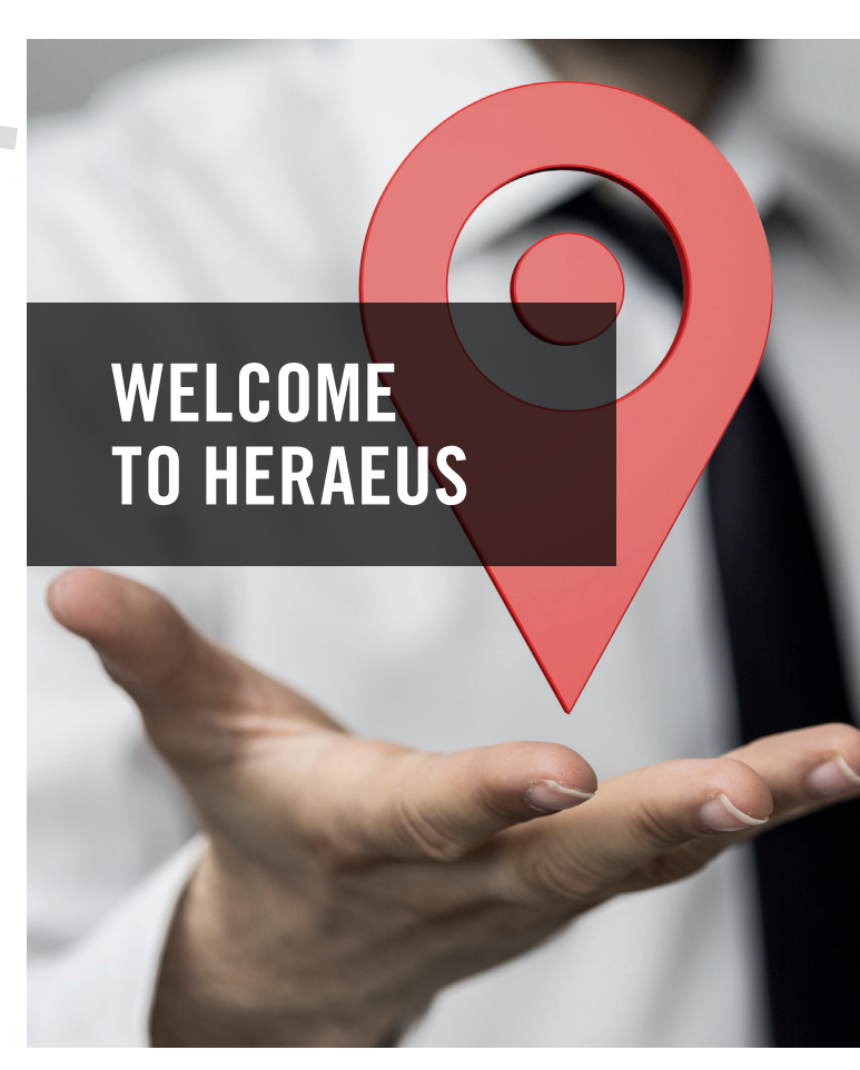
Safety Information and Code of Conduct for the Wehrheim Site