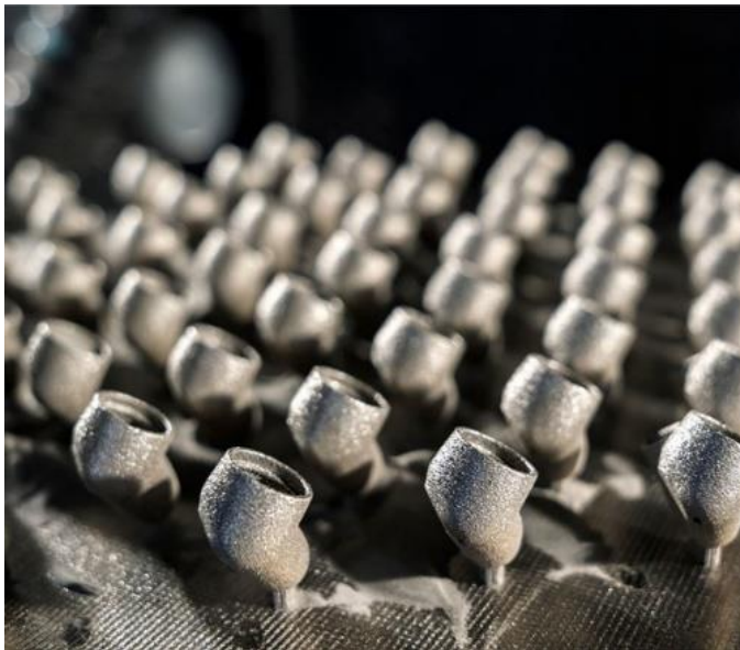
Figure 2: Automated series process in 3D printing via selective laser melting for the production of IE 600 housings

The housing of the IE 600 is manufactured using a 3D printing process based on metal powder, which allows any desired shape within tight tolerances. Chambers and channels are created without CNC post-processing as part of this additive manufacturing process. From the beginning of the collaboration, it was clear that Sennheiser's high quality requirements would shape the subsequent production process. The process includes both automated and manual steps, so that each headphone housing is unique in its depth of production. In the automated printing process, a computer-controlled laser melts one thin layer of AMLOY-ZR01 powder on top of the other, bonding the molten alloy to the already hardened material underneath. Layer by layer, the component thus builds up to its final shape. All residues from the manufacturing process are then removed, followed by thorough cleaning to achieve unparalleled surface cleanliness and quality. The surface is then blasted, polished, and after further surface treatment, the