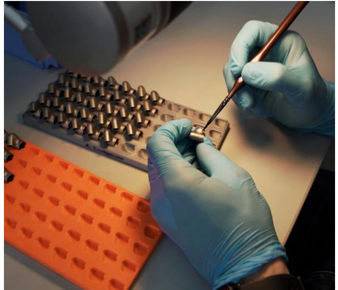
Figure 3: Meticulous craftsmanship for the realization of high quality standards and to ensure lasting product performance

The handmade amorphous metal housing with the unique appearance fits ideally into the Sennheiser audiophile in-ear range and impresses in the sum of the application properties as manufactured. While the robustness and durability of the amorphous housing stands out due to its mechanical strength, absolute hardness, and chemical performance in the field of corrosion resistance, the high wearing comfort due to the low thermal conductivity as well as the optical and haptic surface qualities round off the result to a high-end product.