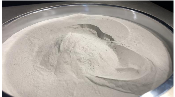
Figure 1: Powder bed fusion with amorphous metal powder

However, the iterative path to the final solution was not long in coming. The entire portfolio of requirements was covered by the exceptional material class of amorphous alloys. Through close coordination in the product development iterations with Sennheiser, the material and process know-how contributed by Heraeus AMLOY even enabled the range of requirements to be exceeded. The amorphous metallic structure offers all the qualitative advantages demanded by the so-called shock-frozen manufacturing process, in which the atoms have no chance to form a crystalline structure as in conventional metals. The result of the manufacturing process is a shiny, satin finish that is exceptionally resistant to corrosion and scratching and guarantees long-lasting enjoyment of the product. The material's high hardness and strength, as well as its high resistance to corrosion, leave no traces in the form of scratches or wear, even with daily use.