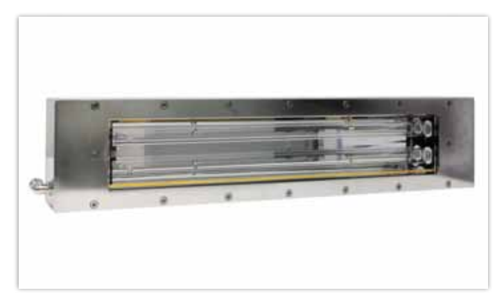
The quartz glass covers of the UV cassettes are provided with a breakage detector patented by Heraeus and thus part of the HACCP concept.

Taking account of various dimensioning criteria and with a suffiently high irradiance, UV disinfection is used as a simple, fast and reliable method in continuous operation in filling plants. However, outside the food production industry as well, e.g. to disinfect packaging materials in the pharmaceutical and cosmetics industry, the method of surface disinfection with UV light makes an important contribution wherever bacteria and viruses need to be inactivated in an environmentally-friendly manner.