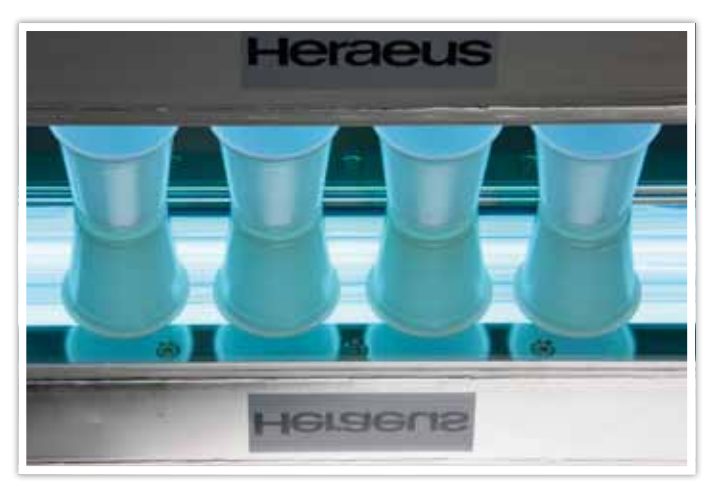
The new Premium UV modules are now even more powerful and safer – with acquisition costs of less than one Cent per disinfected yoghurt cup.

tensity of the radiation is also dependent on the distance between the UV cassette and the packaging. The UV intensity of a lamp decreases with the increase in operating hours. At the end of the lamp operating life there must still be sufficient high UV intensity to ensure a suitable disinfection power and the necessary lethal dose in the given radiation time. Experience with Yoghurt filling for example has shown that pots of a depth of 150 millimeters (mm) can be effectively disinfected within four seconds and sealing foils in two seconds at the same intensity.