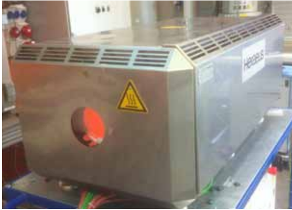
A MAX oven for in-line continuous operation