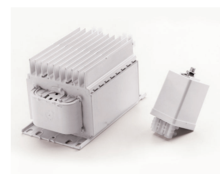
Power supplies are offered to match the UV lamps.

QC Lamp: power range 1-30kW, no base, bare leads, pinch-seal