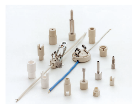
Different ceramic bases for medium pressure UV lamps. Further models available on request.