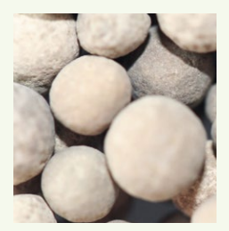
HeraPur<sup>®</sup> K-0264 Pd Catalyst