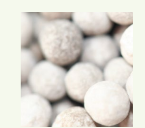
HeraPur<sup>®</sup> K-0152 Pt Catalyst